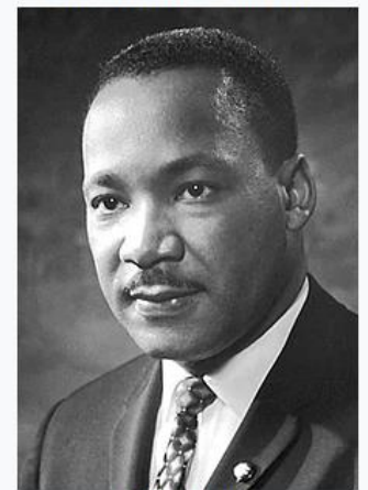
King in 1964